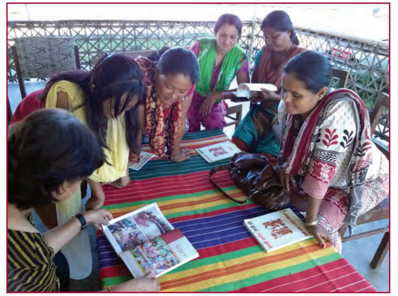
Continued on Page 5.

Already a booming business in India, where estimates suggest that 25,000 couples a year travel to arrange surrogacy contracts and there are about 1,000 surrogacy centers, this practice is soon expected to extend to Nepal, where poor women with limited economic opportunities will likely be attracted by the prospect